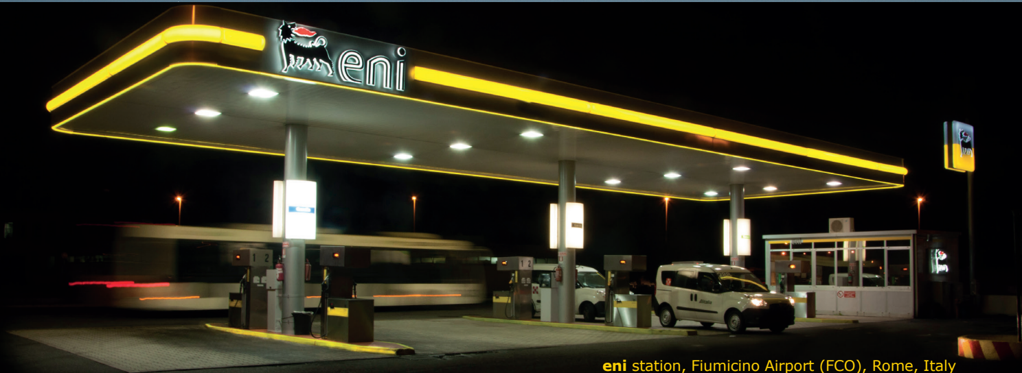
eni station, Fiumicino Airport (FCO), Rome, Italy